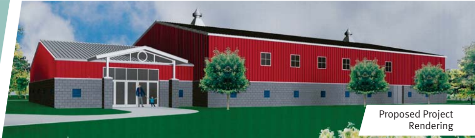
Proposed Project Rendering

The Otto Graham Gymnasium and Activity Center is ready to be built. We have redesigned the plans to make it a more affordable project. We are almost there! So far, we have raised 85% of our project total – almost $2 Million! Support is now essential – we need your help to make this a reality. We are hopeful that, with the help of our supporters, we can accomplish our final $500,000 goal and break ground by the end of summer! No donation is too small - we need EVERYONE'S help!